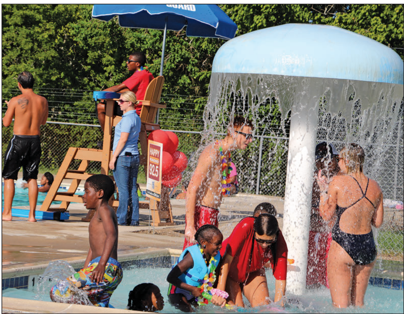
Bay City Parks & Recreation Up, Up & Away Pool Party at Hilliard Pool Saturday, sponsored by Happy Radio 92.5, drew a lot of happy swimmers of all ages.